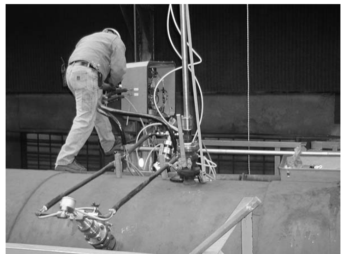
Verabar Model V550 Installed